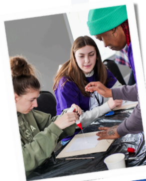
The Village hosted crafts at MBC Winter Family Camp near Hutsville